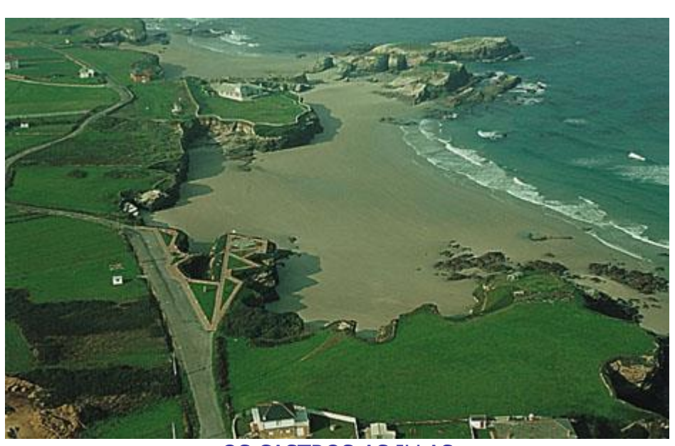
OS CASTROS-AS ILLAS